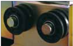
Ball bearing wheels

* Duty Cycles depend on gate size and installation