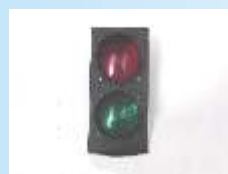
Traffic light For order contact SEA USA