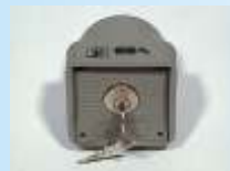
KEY SWITCH START-STOP