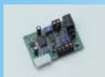
DECODER MODULE FOR ITEMS 23105167