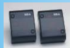
PHOTOCELLS FOTO 40 SURFACE MOUNTING