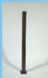
SUPPORT FOR MAGNETIC CARD READER