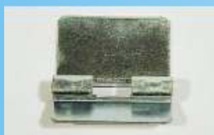
COUPLING PLATE FOR DOUBLE LEAVES GATE (VERTICAL)