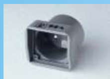
PLASTIC BOX FOR PHOTOCELLS