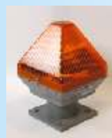
SMALL FLASHING LAMP WITH CARD