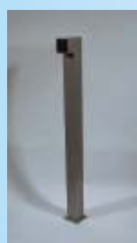
SUPPORT FOR KEY SWITCH