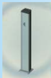
SUPPORT FOR PHOTOCELLS FOTO 40