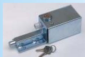
ELECTRIC LOCK (VERTICAL)