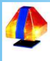
WARNING LAMP WITH FLASHING CARD