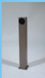
SUPPORT FOR PHOTOCELLS FOTO 50