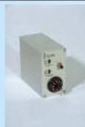
LOOP DETECTOR ( UNDERGROUND )