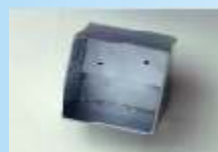
METAL BOX FOR PHOTOCELLS FOTO 50 AND KEY SWITCH