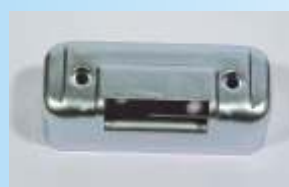
COUPLING PLATE FOR SINGLE LEAF GATE (HORIZONTAL)