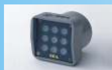
DIGITAL SWITCH WITH DECODER ANTI-VANDALIC