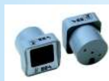
PHOTOCELLS FOTO 50 FLASH MOUNTING