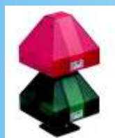
TRAFFIC LIGHTS: RED-GREEN contact SEA USA