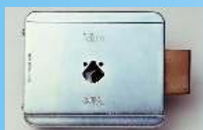
ELECTRIC LOCK FOR OPERATORS WITHOUT HYDRAULIC LOCK