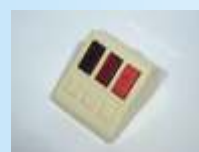
PUSH BUTTON BOARD