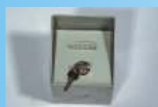
MAGNETIC CARD READER Cod. 23105045