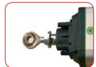
Round joint for stroke adjustment