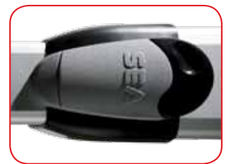
Optional metal standard release PLUS