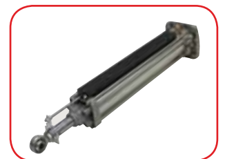
POSITION GATE Absolute Encoder