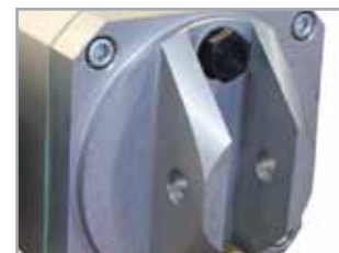
Back flange in solid machined aluminium