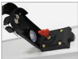
Release system protected by metal lock with release key at the inside