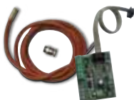
Kit Probe to manage low temperature + card LE + cable 6 Ft