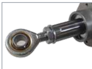
Round joint for stroke adjustment