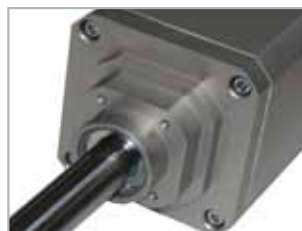
Front flange in solid machined aluminium