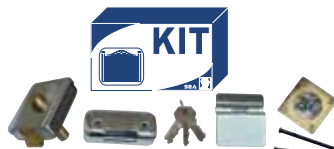
Electric lock Counter-plate for horizontal or vertical mounting external and internal cylinder