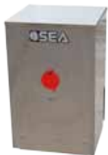
Case in stainless steel