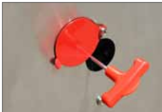
User friendly manual release with key