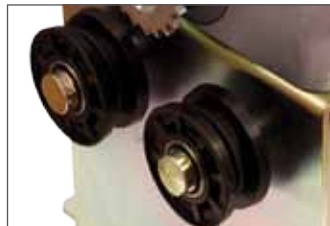
Ball bearing wheels