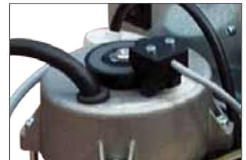
Encoder for obstacle reverse