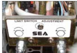
Mechanical limit switches screw adjustable